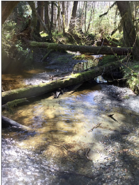
Figure 1.–Tributary 2 near confluence with main channel at waypoint 98.