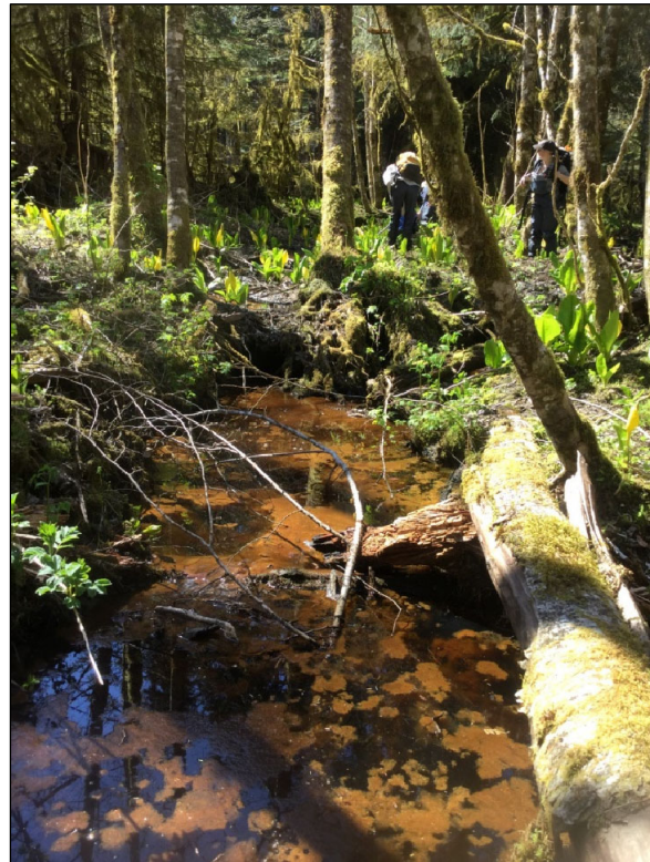
Figure 2.–Tributary 2 with low flow and algae at waypoint 96.